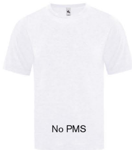
WHITE FLECK TRIBLEND

Textile fabric colours are subject to dye lot variation and will not be exact match to print pantone reference