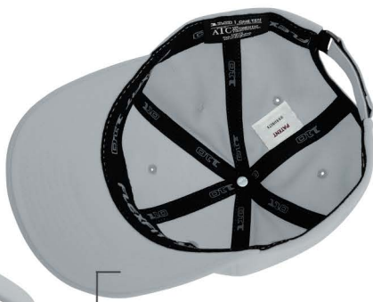
Matching under visor