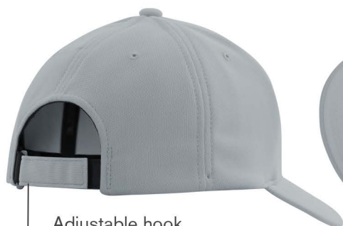
Adjustable hook and loop closure